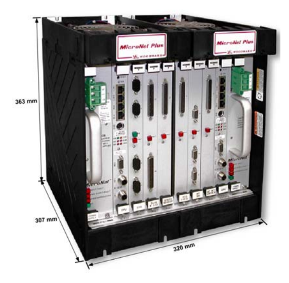
MicroNet Plus Control Chassis (8 VME slot option)

Power supplies may be simplex or redundant in any combination of input voltages.