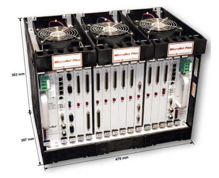
MicroNet Plus Control Chassis (14 VME slot option)

Full-size Chassis 14 VMENarrow Chassis 8 VME